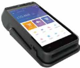
Docking station optional

Featuring a large 5.5-inch touch screen and powerful processing capabilities, the APOS A8 provides merchants best-in-class user experience to operate their integrated POS in an all-in-one handheld device.